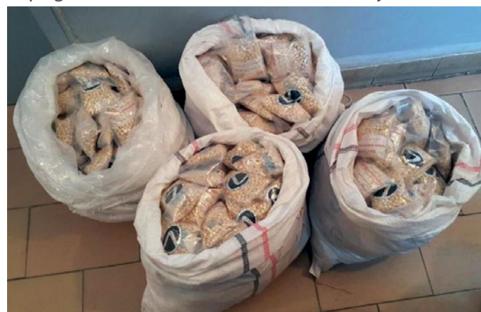
FIGURE 4 Captagon tablets seized in a Lebanese laboratory

Tens of millions of tablets, most of which were identified as 'captagon' were also seized between 2010 and 2014 in Iraq, Jordan, Lebanon and Syria (Figure 4). These countries are usually assumed to be transit or production territories for illicit captagon and not large consumer markets. This may be changing, however, as some recent information suggests that consumption in this area, particularly in Syria, may be increasing (UNODC, 2014, 2016).