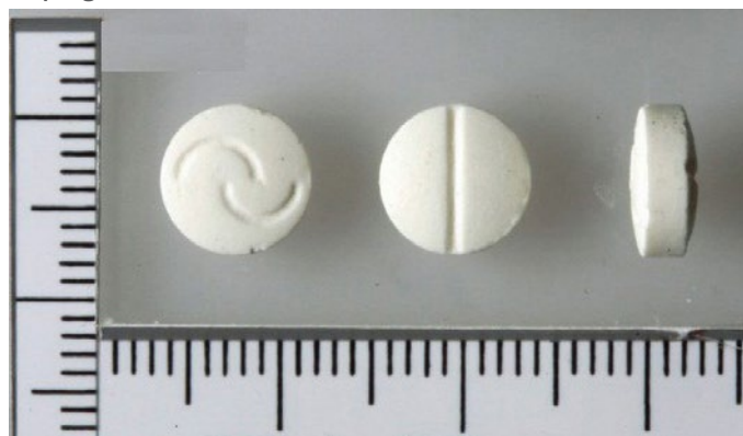
FIGURE 2 Captagon tablets